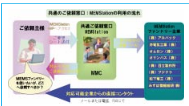
Photo 2 How the MEMStation works