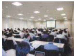
The Annual Meeting

The second day's session on June 16 featured group discussions, a technical committee meeting, reports on the results of the group discussions, oral presentations, and a ceremony to present the Best Poster Award and the Outstanding Poster Awards.