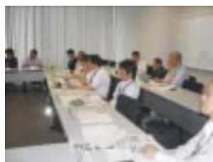
Technical committee meeting