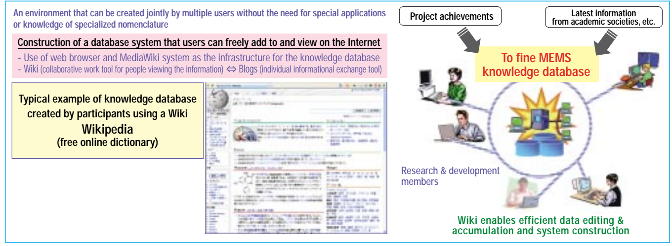
Fig. 1 Construction of an Internet-based Shared Collaboration Environment

By FY 2007, more than 1000 items of knowledge data had been registered to the MemsONE database, exceeding the target of 1,000 items. The stored data has been organized around four MemsONE categories (process, device, material properties, analysis) using keywords developed in this study. The knowledge data is also being augmented through the addition of laid-open patent data and Western patent analysis references corresponding to development topics. To enable users to quickly locate the information they need, a full text search function using a precision Japanese language search engine and various types of ranking display functions that allow visualization of the status of the data stored in the database have been provided. In the remaining six months of the database construction project, efforts have focused on improving the quality of the registered data, updating patent data, building a top page for general Web access and creating terms of use and guidelines, and the work is progressing at a fever pitch. The database will be made available on the Internet at the beginning of FY 2009, and activities to encourage ongoing improvement of the knowledge data will be conducted to enable the database to be used as a part of Japan's industrial infrastructure.