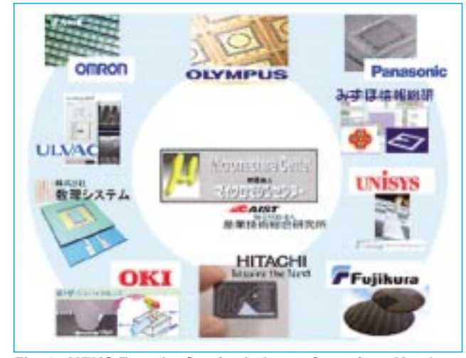
Fig. 1 MEMS Foundry Service Industry Committee Members

The MEMS Foundry Service Industry Committee membership comprises 11 companies and organizations relating to MEMS foundries, each with its own unique characteristics (Fig. 1 and Fig. 2).