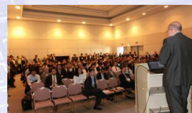
International Symposium 2014