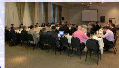
World Micromachine Summit 2014