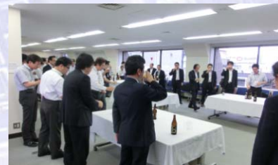
Network meeting of MEMS forum