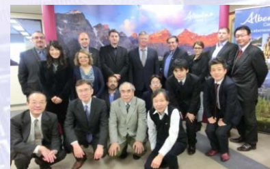
International affiliation meeting 2014

Contact info Address : MBR99 Building 6F, 67 KandaSakumagashi Chiyoda-ku, Tokyo 101-0026, Japan e-mail : front@mmc.or.jp Phone : +81-3-5835-1870 Fax : +81-3-5835-1873